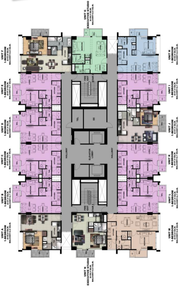
TYPICAL FLOOR PLAN LAYOUT 5 TH , 7 TH , 9 TH , 11 TH , 14 TH , 16 TH Floor TOWER C