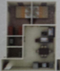
2 Bedroom A 52 sq.m. / 559 sq.ft.