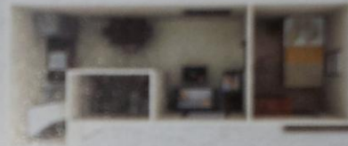
1 Bedroom C (w/balcony) 29 sq.m. / 311 sq.ft.