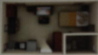
Studio A 22 sq.m. / 236 sq.ft.