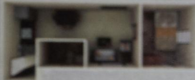
1 Bedroom C 26 sq.m. / 279 sq.ft.