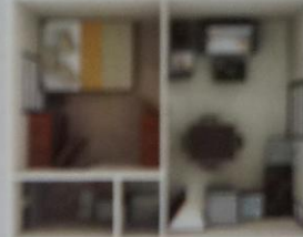
1 Bedroom B 29 sq.m. / 311 sq.ft.