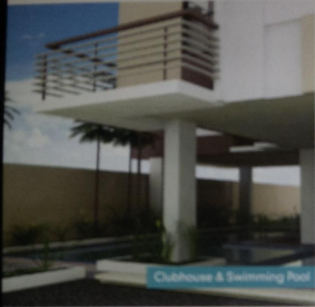
Clubhouse & Swimming Pool