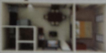
1 Bedroom A 34 sq.m. / 365 sq.ft.