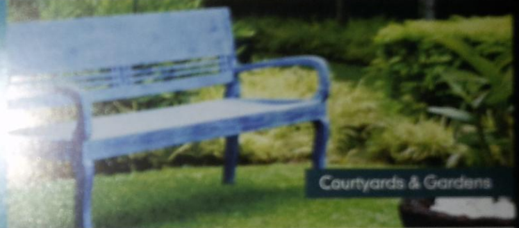
Courtyards & Gardens