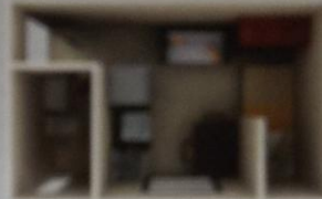
Studio B 14 sq.m. / 150 sq.ft.